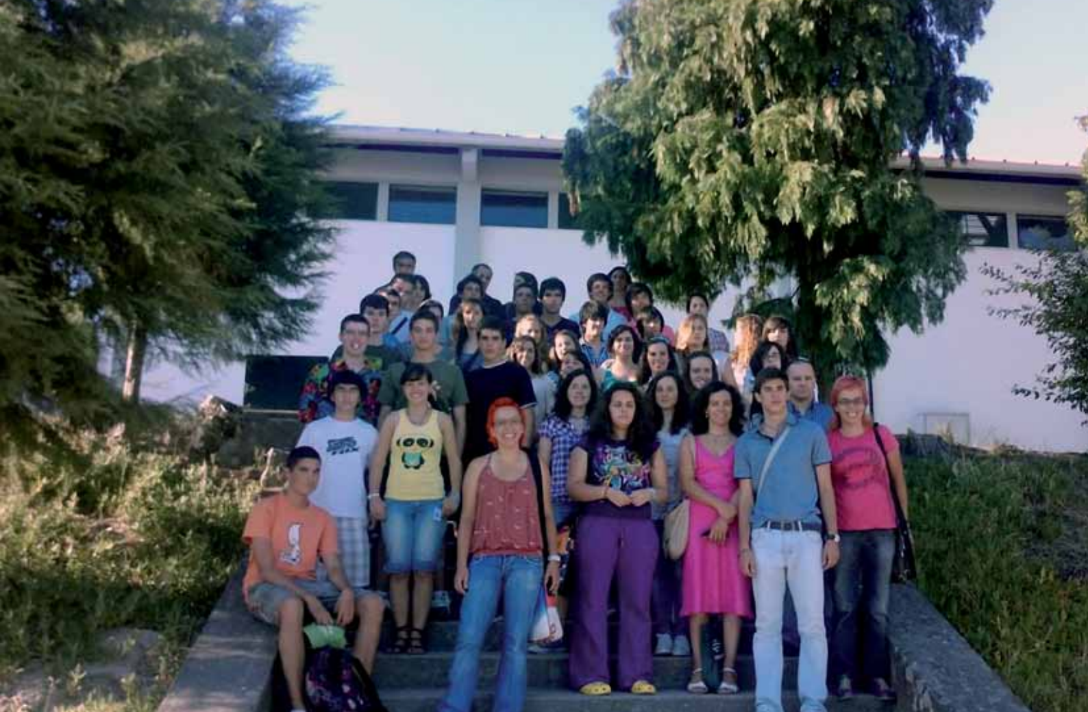
The first group photo at the headquarters of Regimento de Cavalaria nº6 de Braga