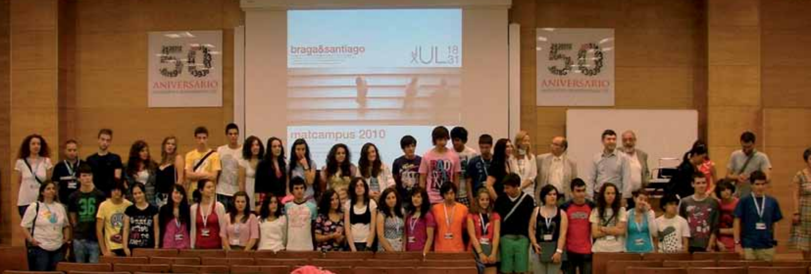
Group photo in Aula Magna, USC