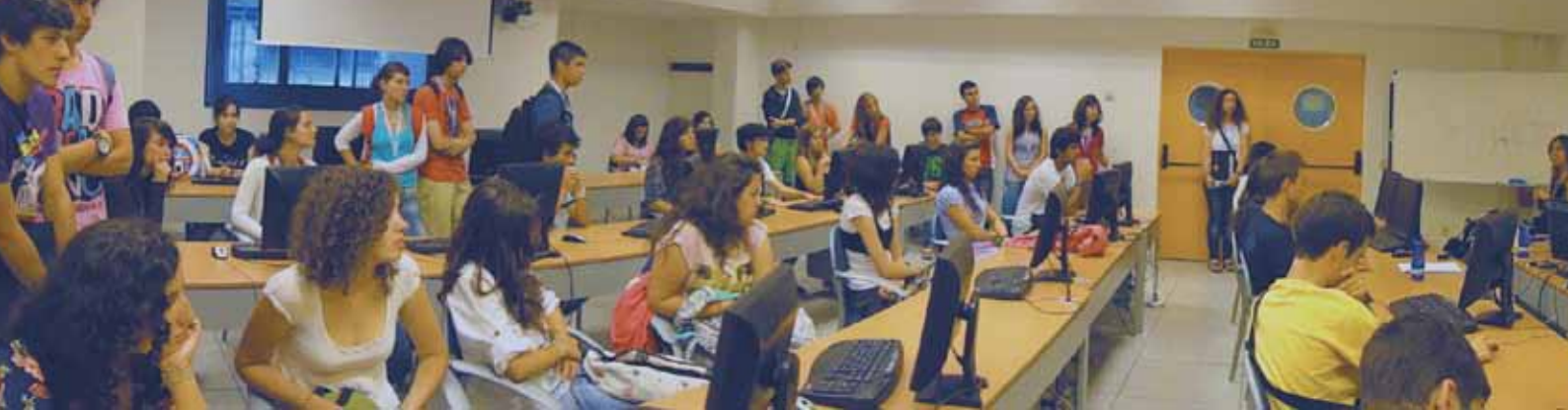
One of the classrooms where the students attended sessions

The officer in charge of the headquarters where the students stayed during the first week kindly offered the participants a pleasant afternoon, showing them the facilities, along with some military exercises and allowing each student to have a ride on their magnificent horses.