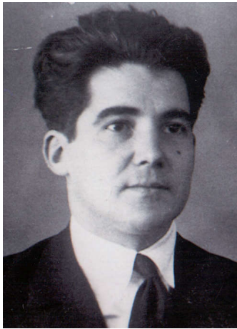
Bento Jesus Caraça

We will be talking about Professor Bento Caraça the man , who, from his birth in 1901, fought for survival and was only saved by a miracle. A life which only lasted 47 years, but which was enough to enrich his era and to bequeath to us a cultural and ethical legacy of the highest and incomparable value.