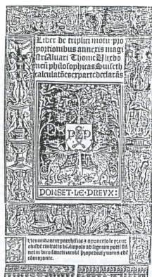
Front page of the Liber de triplici motu