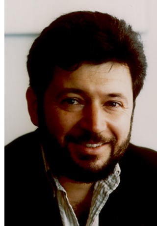
Efim I. Zelmanov

Additional information: Editor-in-Chief of Zentralblatt für Mathematik. Managing Editor of Beiträge zur Algebra und Geometrie/Contributions to Algebra and Geometry.