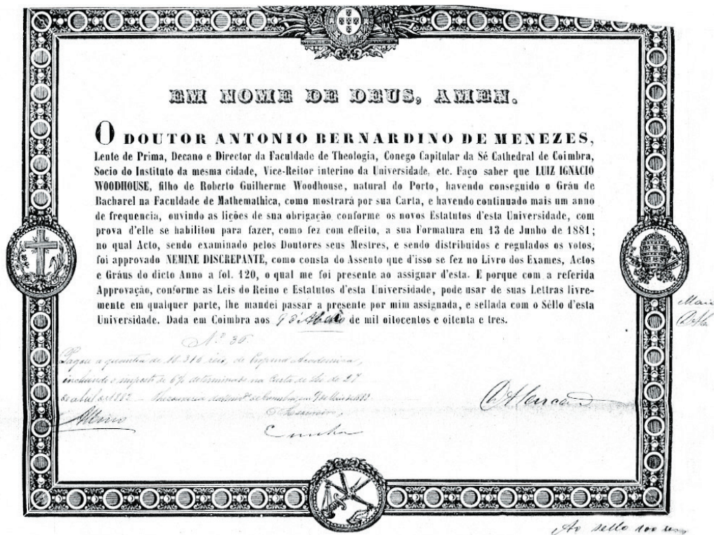
Figure 1. —Certificate of Woodhouse's degree.