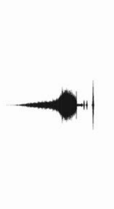
Figure 1.—An approximation to the density spectrum of a random sum-free set. We choose a sum-free set of natural numbers in order: if n is the sum of two numbers in the set, then n is excluded, otherwise we toss a fair coin to decide whether to include n . The spikes on the right of the picture can be explained; for example, the biggest spike corresponds to sets of odd numbers, which occur with probability about 0.218 ("Cameron's constant"). The shape on the left, however, is still a mystery.

Algebra is the best example of how the abstract method has revolutionised mathematics and its applications.