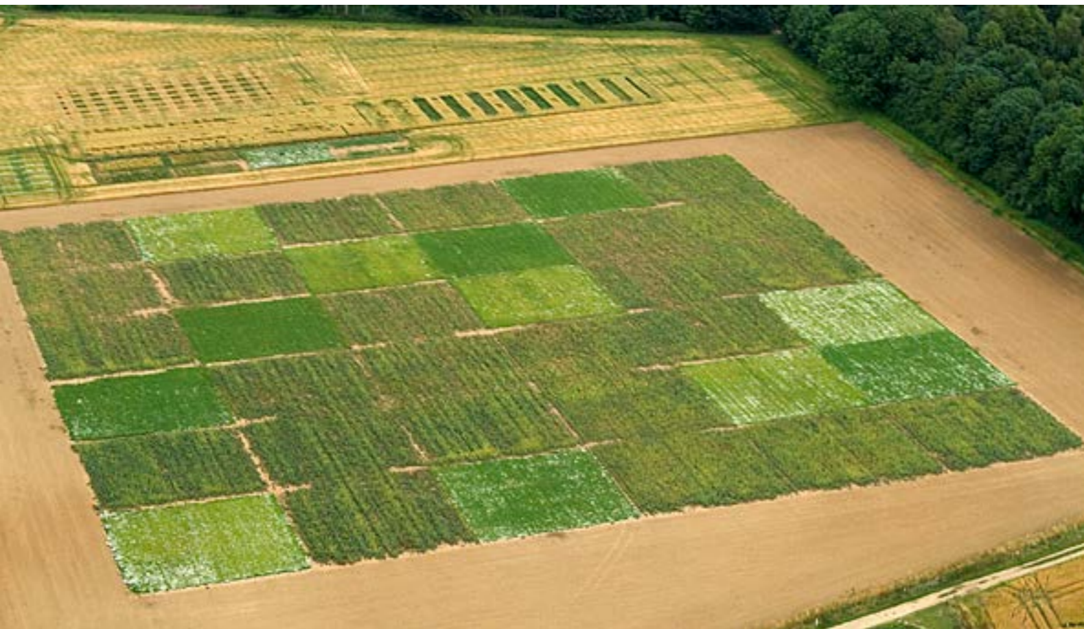
Figure 2.—A Latin square, used in agricultural research at Rothamsted Experimental Station. Latin squares are the Cayley tables of quasigroups.

ics which also have practical importance, such as Latin squares (see Fig. 2).